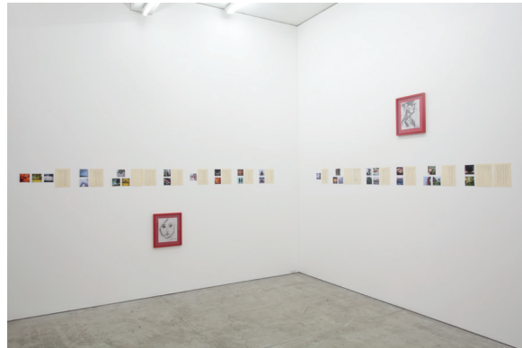
Tatsuo Majima, Beijing Diary , 2010 Ink on paper, Type-C print Installation view at TARO NASU, 2010 (Photo: Keizo Kioku) © Tatsuo Majima Courtesy of TARO NASU