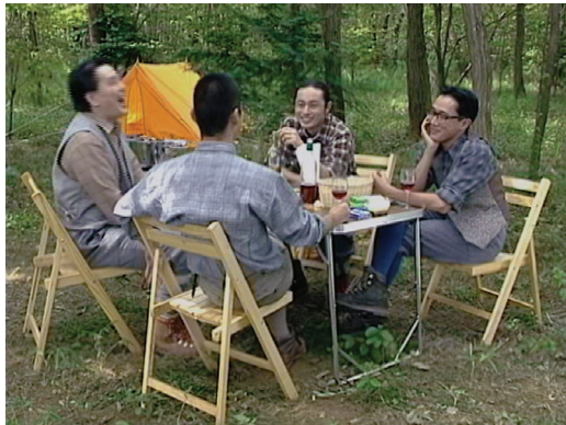
Tatsuo Majima, Japanese Modern Art/The Cheerful Country , 1995 Video, 33 min. Video still