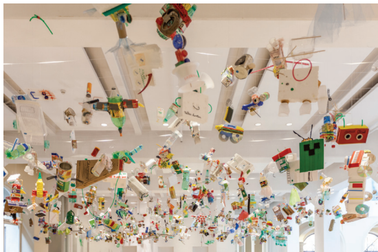
Installation view of Children Da Vincis , Prédio Histórico dos Correios, São Paulo, 2013.

Press Inquiries: Parasophia Office 645 Tearaimizu-cho, Nakagyo-ku, Kyoto 604-8152 JAPAN