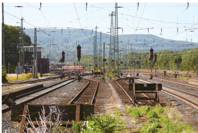
Susan Philipsz, Study for Strings , 2012. Installation view at Kassel Hauptbahnhof, Kassel. Photo by Eoghan McTigue, courtesy of the artist, Galerie Isabella Bortolozzi, Berlin and Tanya Bonakdar Gallery, New York. © Susan Philipsz

b. 1965 in Glasgow; based in Berlin www.susanphilipszyouarenotalone.com