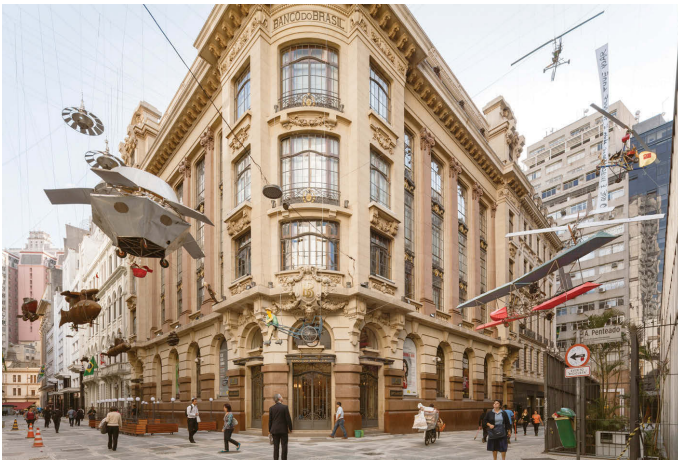
Installation view of Cai Guo-Qiang: Da Vincis do Povo in the street outside Centro Cultural Banco do Brasil, São Paulo, 2013.