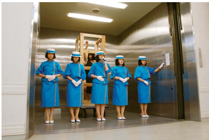
Miwa Yanagi Theater Project, 1924 Machine Man , 2012.

b. 1967 in Kobe, Japan; based in Kyoto www.yanagimiwa.net