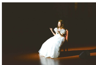
Dominique Gonzalez-Foerster, M.2062 (Scarlett) . Photo by Tadashi Hayashi