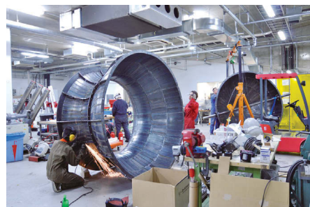
Inside Ultra Factory