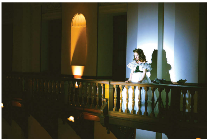
Dominique Gonzalez-Foerster, M.2062 (Scarlett) , Sept. 6, 2013. Parasophia: Kyoto International Festival of Contemporary Culture 2015 Open Research Program. Photo by Tadashi Hayashi, courtesy of Parasophia Office. © Dominique Gonzalez-Foerster

b. 1965 in Strasbourg, France Based in Paris and Rio de Janeiro www.dgf5.com