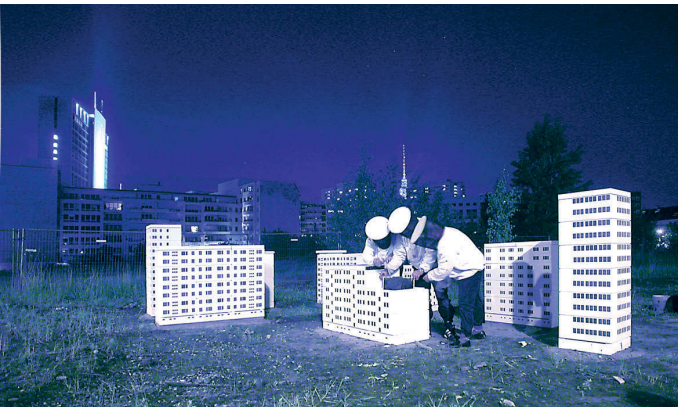
Hoefner/Sachs, Honey Neustadt , 2006. © Hoefner/Sachs

b. 1974 in Stuttgart, Germany; based in Berlin