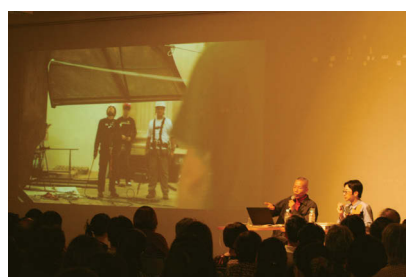
Cai Guo-Qiang in Conversation with Akira Asada